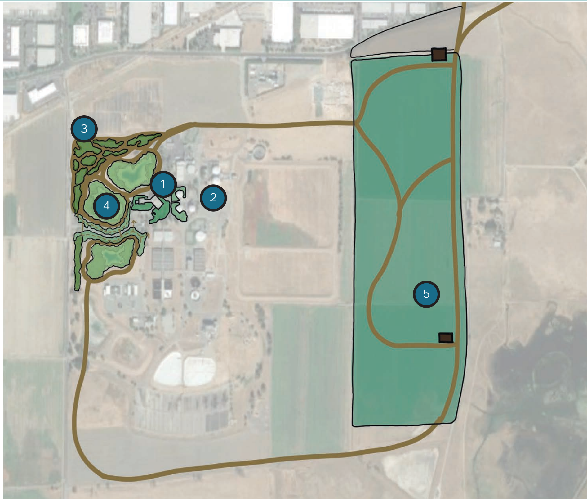
Site Map indicating site wide opportunities for STEAM project installations - NTS