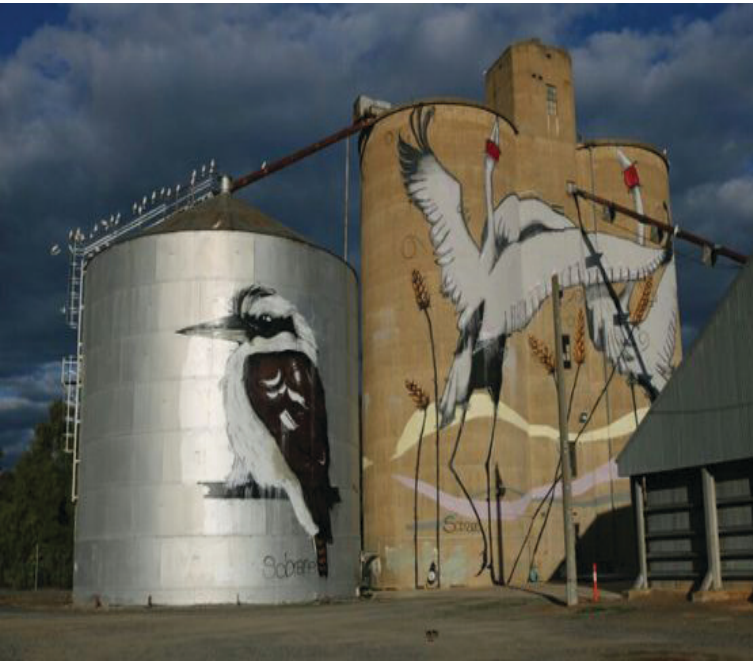
Image of similar tank artwork

The Cultural and Science, Technology, Arts and Math (STEAM) outreach initiative identifies opportunities for engagement with artists, educators, and students to tell the important story of our human relationship with the water cycle and pollution prevention (P2). Spaces throughout the treatment plant could become a community living laboratory, gathering area, and/or inspirational outreach center for exploration of scientific concepts through the expression of functional public art.