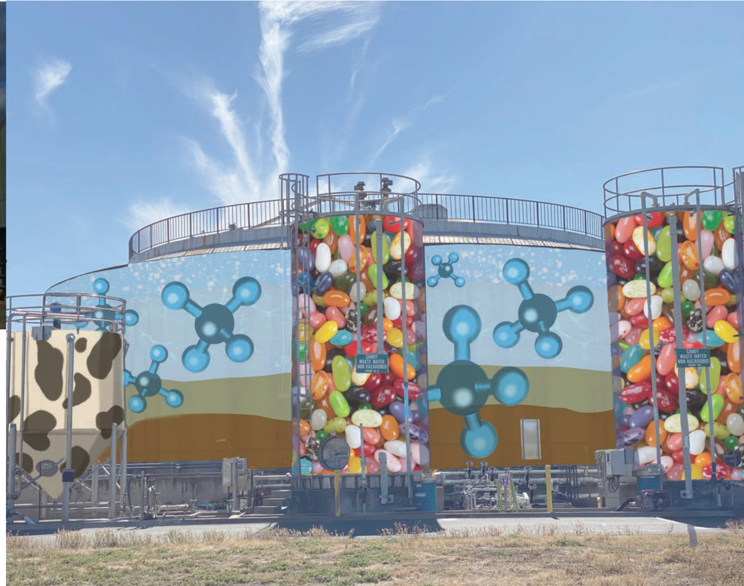
Existing tanks with murals or vinyl art-overlay